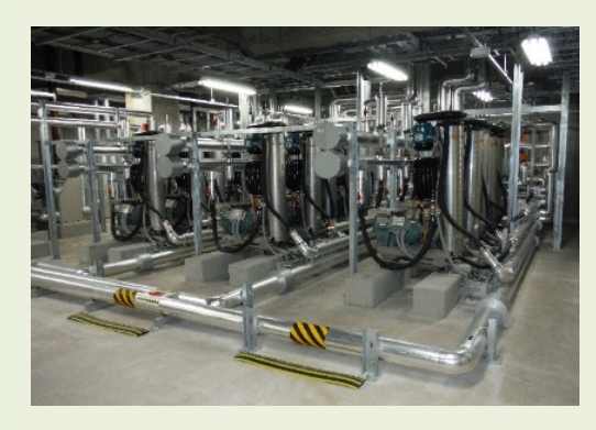
Japan post-quake reconstruction

meanwhile our lights export to Korea, Pakistan, Malaysia, South Africa, Middle East, etc. We completed numerous projects in many countries such as Japan post-quake reconstruction, Djibouti Chinese military harbour, China Tianjin 336.9m Jin Tower lighting project, etc.