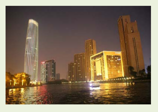
Tianjin 336.9m Jin Tower lighting project

As a reliable supplier, DL Group established long term relations with clients by its excellent quality, competitive price and professional supporting service.