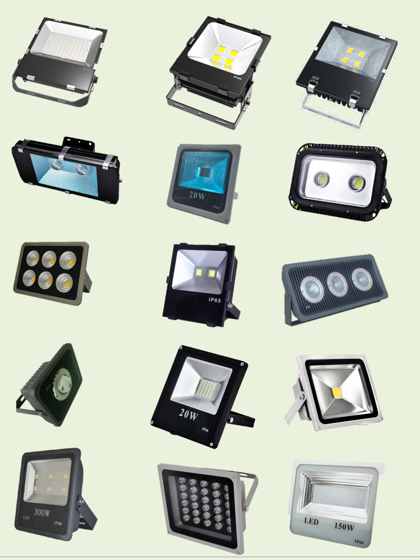
DL Industrial Group Ltd. |