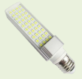
More light, please contact us. Thank you.